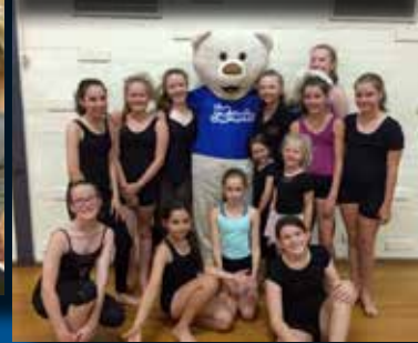
Paramount Calisthenics College with Cali Bear