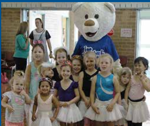
Pictured above is Eltham Calisthenics College Tinies with Cali Bear

For all Cali Bear enquiries please email marketing@calisthenics.asn.au