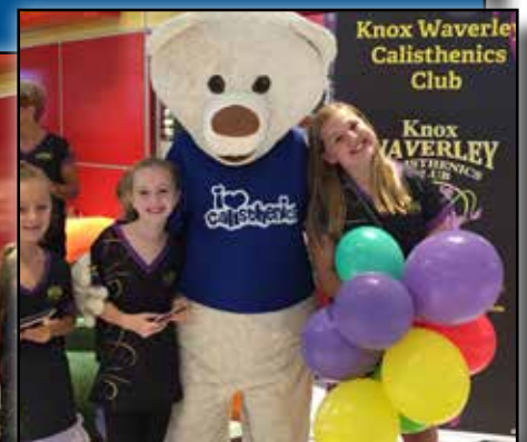
Pictured above is Cali Bear with Knox Waverly Calisthenics Club at Knox Westfield Shopping Centre